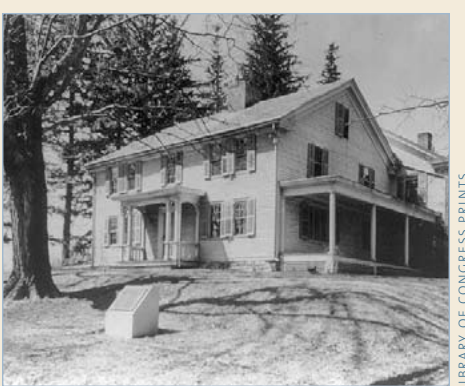
Arrowhead, where Melville wrote Moby-Dick